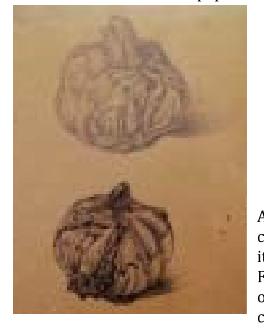
Gouache paints, A4

Study of garlic 2B&3B pencils and black biro on brown paper