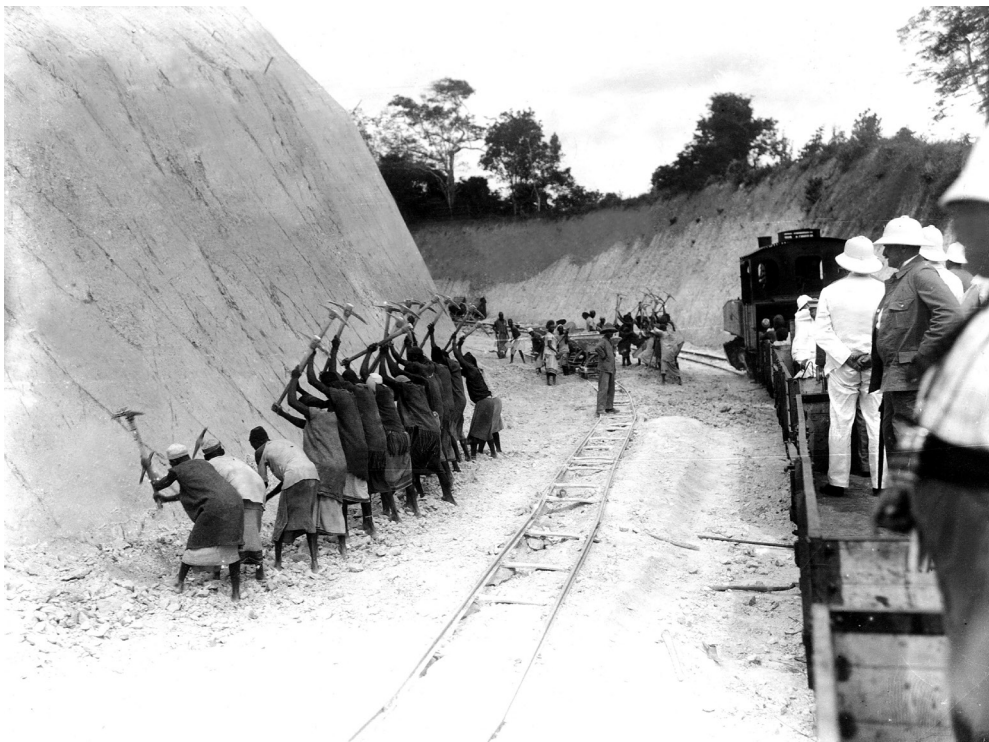
A photograph published in a German newspaper showing local people working on the construction of a railway in German East Africa, 1911.

Answer both parts of the question with reference to the sources.